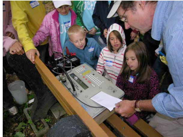
Georgia Mountain Center for Research and Education, site for "science field days".