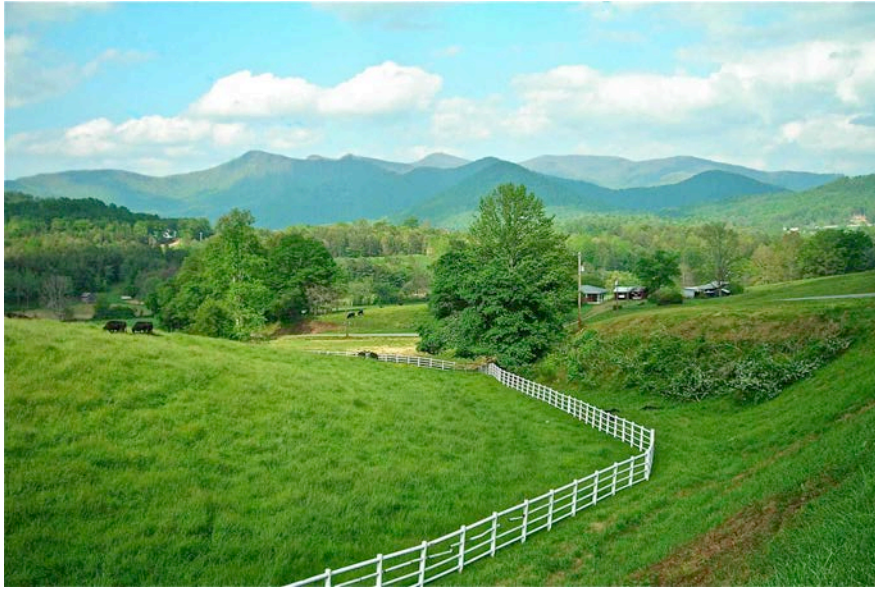
Brasstown Bald and adjacent peaks in the Blue Ridge Mountains of Georgia.

We began our deployment in 2010 with a 7-station test array. These stations were installed on cement piers; at one station we installed a second instrument using the "direct-burial" method (sand base; no pier) for comparison ( Parker et al., 2011 ). Based on the strong similarity of waveforms observed for those two instruments, we switched to direct-burial for subsequent installations in 2011 (36 instruments) and 2012 (42 instruments).