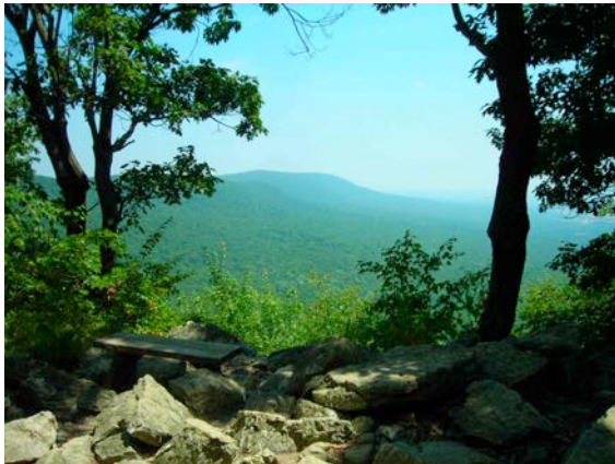
View of Hawk Mountain, along the southeastern flank of the Valley & Ridge in Pennsylvania.