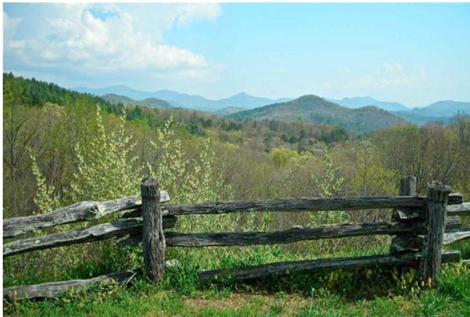
Looking north across the Blue Ridge Mountains of northeastern Georgia and western North Carolina.